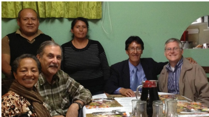
Before feasting on the Guinea Pig