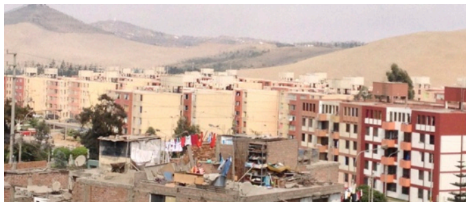
City of Huancayo where our second marriage was held.