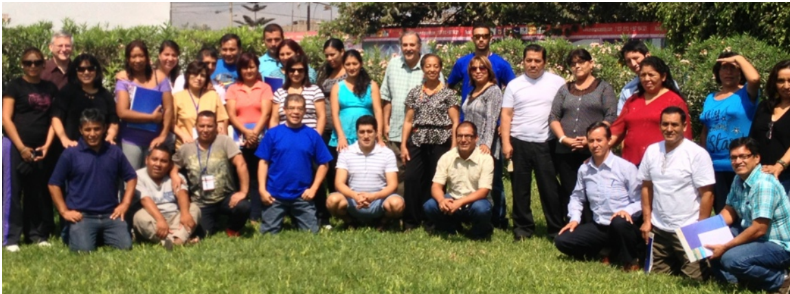
Our first marriage seminar in Lima

The first seminar is already over! Praise God there was very positive response. "Mucho, mucho gracias!" I could even understand one husband looking right at me when stating this signifying the many changes that took place in his life. Many were significantly helped. We found out that the hotel had booked another party so that we could not get the numbers to attend that they originally hoped for. We were glad for a smaller group.